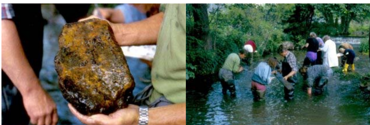
Table 1. Sample sites on the River Skalice